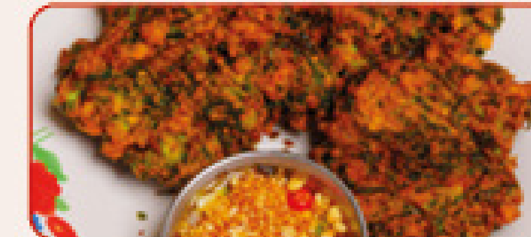
ทอดมันป่า Jungle herb fritters, sweet chilli and peanut dressing