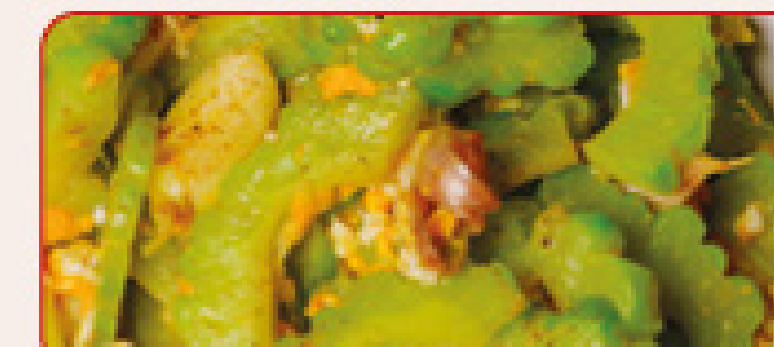
ผัดมะระใส่ไข่ Stir fried bitter melon with egg