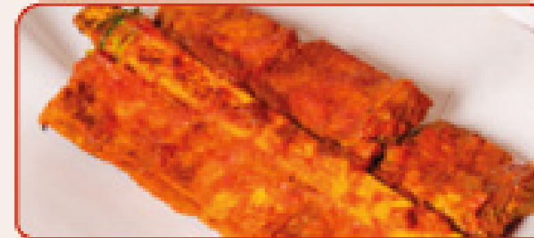
เต้าหู้ทอดและ Grilled tofu, southern red curry sauce, tamarind