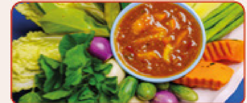
น้ำจิ้มใส่มะเขือ Bellish with orange subergine and seasonal vegetables